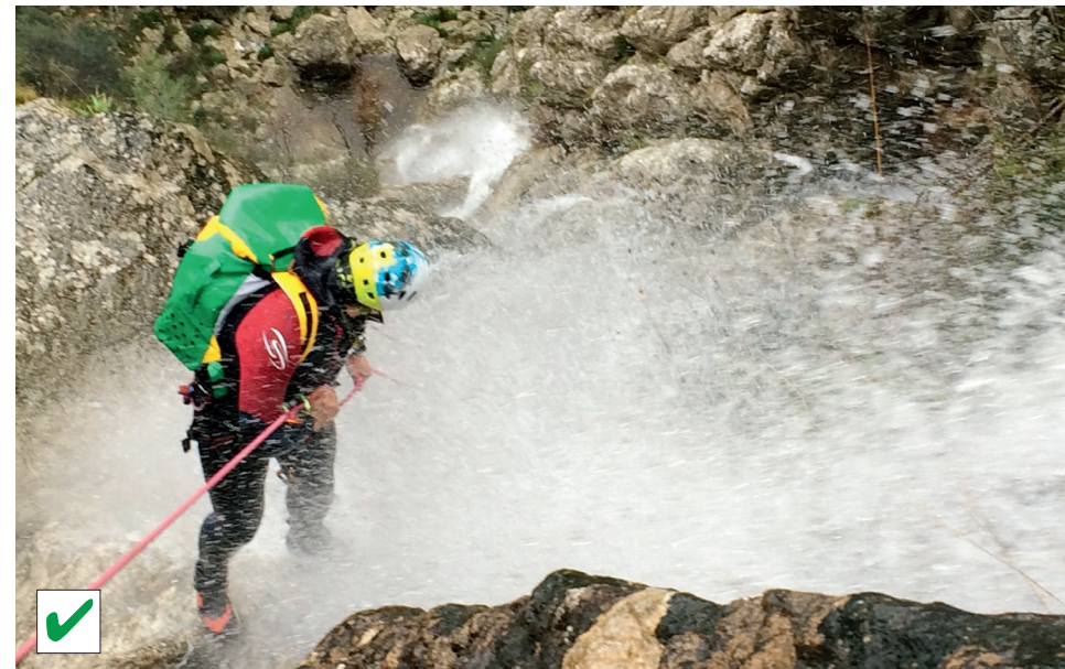
Practice the activity safely and enjoy the environment.